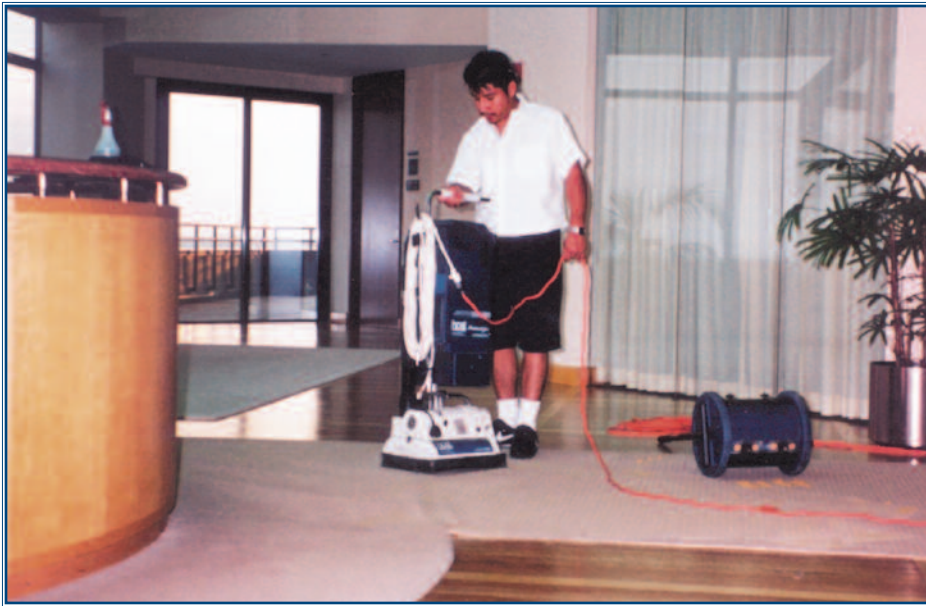
Chip calculates that the Freestyle® picks up HOST SPONGES® five times as fast and eliminates the need for an additional worker to run an upright vacuum.

can make all the carpet look like that?’ I replied confidently that I could, and the job was mine. I charged a fair price for the carpet restoration and set up a maintenance cleaning for the complex thereafter.”