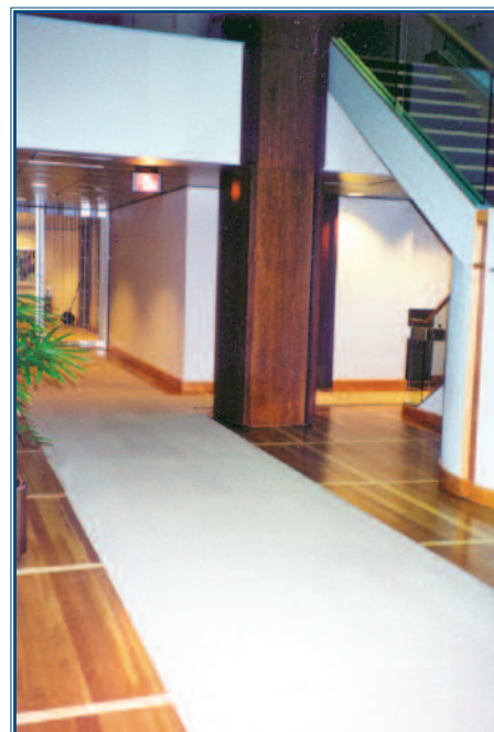
Classic Contract Cleaning maintains all of the carpet in this new facility, including carpet tile, broadloom and a very large carpeted cafeteria that is used by thousands of people daily.

“If a maintenance contract works out to be best maintained on a quarterly frequency, I structure the proposal so that it fits in with the